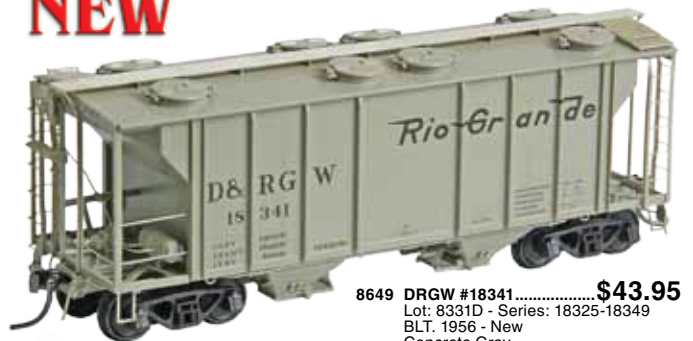
8649 DRGW #18341 ..... $43.95 Lot: 8331D - Series: 18325-18349 BLT. 1956 - New Concrete Gray