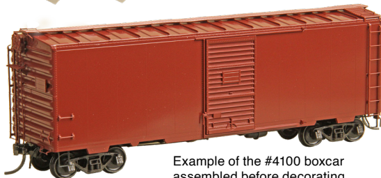
Example of the #4100 boxcar assembled before decorating.

Specific details about each boxcar can be found on the individual product page on our website.