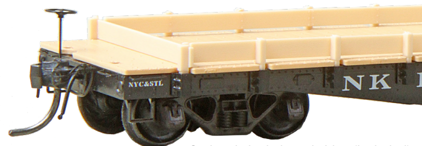
Optional single board sides (included)