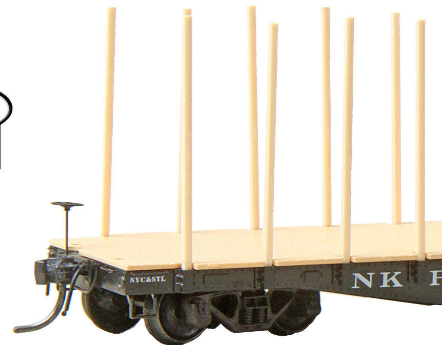
Optional stake poles (included)