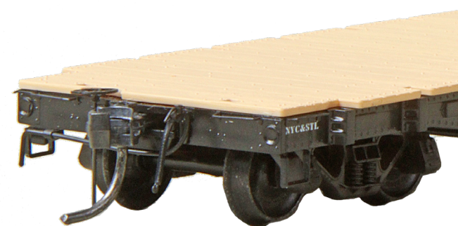
Drop-staff brake wheel - down