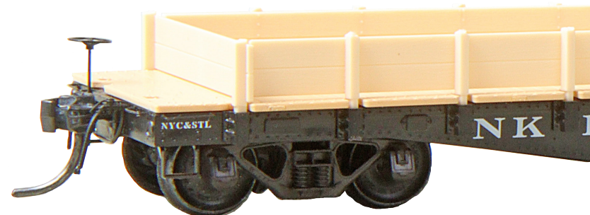
Optional double board sides (included)