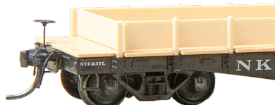
Optional double board sides (included)