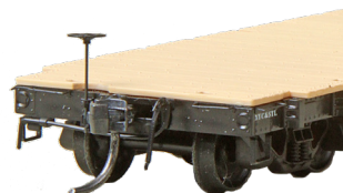
Drop-staff brake wheel - up