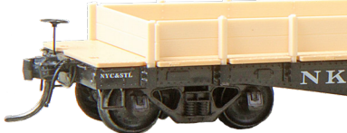
Optional double board sides (included)