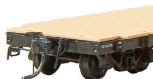
Drop-staff brake wheel - down