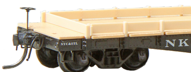
Optional single board sides (included)