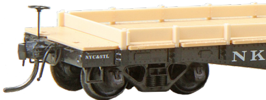
Optional single board sides (included)