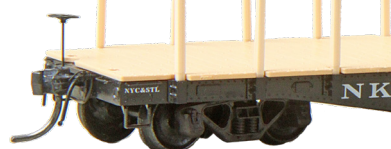
Optional stake poles (included)