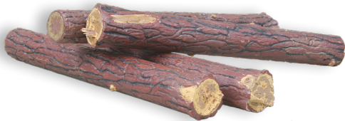
LL LOG LOADS (Unpainted) .....$5.10