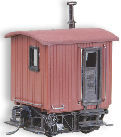
#104 Logging Caboose Kit.....$24.85