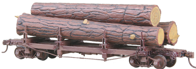
#103 Truss Log Car Kit (with Logs).....$40.35