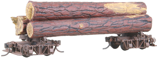
#101 Disconnect Log Car Kit (with Logs).....$26.95

Highly detailed logging equipment with fully sprung metal trucks, smooth rolling ribbed back wheels, die-cast center beam, log bunks and falling stakes; the #103 kit also included metal one piece truss rods with see through turnbuckles. The #101, #102, #103 kits come with three unpainted plastic logs. Each kit comes with Magne-Matic® Metal Couplers.