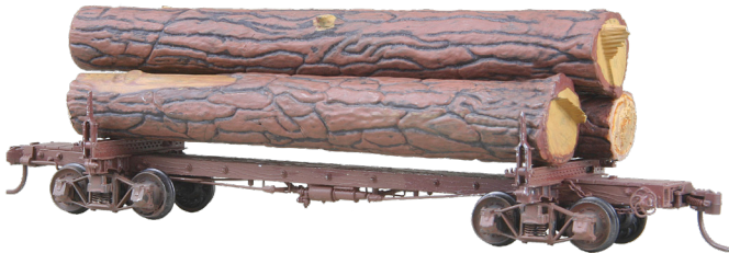
#102 Skeleton Log Car Kit (with Logs).....$33.25